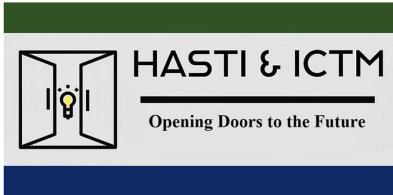
EXHIBIT AND SPONSOR INFORMATION